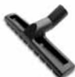
All purpose floor tool (300mm) 6.906-512.0