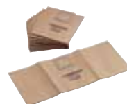
Paper filter bag 9.533-212.0