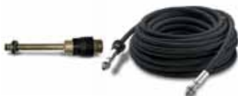
Adapter, required for hose reel kit 4.421-739.0