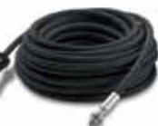
repl. HP hose 15m for hose reel kit 6.391-417.0