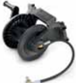
Hose reel kit 2.642-756.0