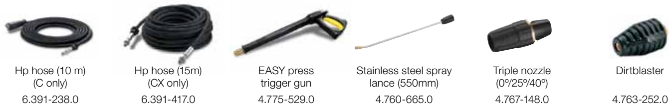
Hp hose (10 m) (C only) 6.391-238.0