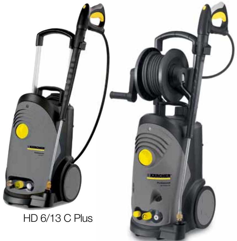
HD 6/13 C Plus

Designed for high performance cleaning of machinery, vehicles or yards on a daily basis. High water flow and pressure rates ensure thorough cleaning results even with stubborn dirt, while the variable pressure and water flow rate ensure quick, efficient results. Featuring a dirtblaster nozzle for faster cleaning of tough dirt, and a three-way nozzle that enables the water jet to be adjusted quickly between a high-pressure pencil jet, a high-pressure fan jet and a low-pressure fan jet. Ideal for fast and tough cleaning jobs on the farm, in the workshop and in car fleets and dealerships.